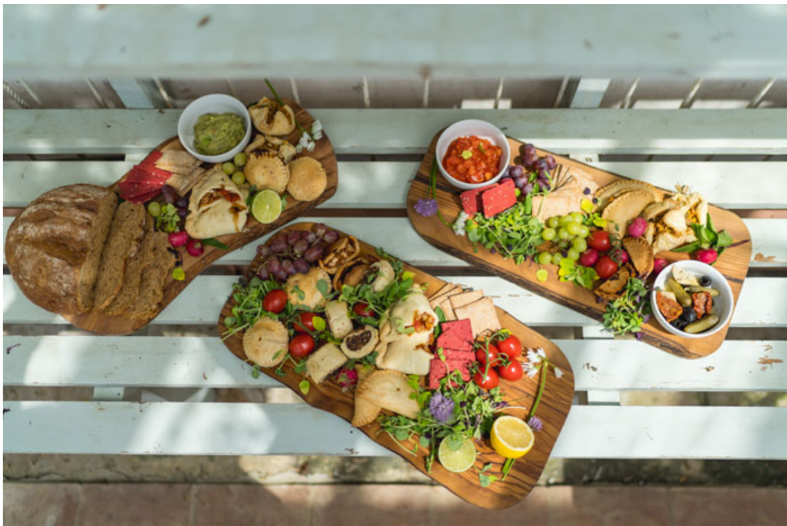
A bird's eye view of the spring/summer shoot at Stradsett Hall